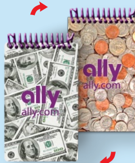
Mini Notebooks NBM-952-I