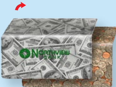
Checkbook Covers CBC-952-I