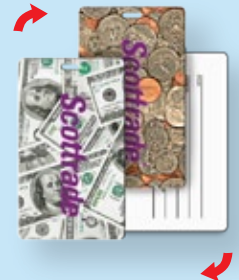
Luggage Tags LT01-952-I