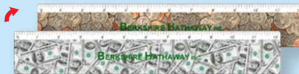
12 Inch Rulers RU12-952-I