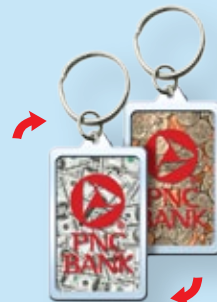
Acrylic Key Tags KC02-952-I