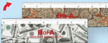
6 Inch Rulers RU06-952-I