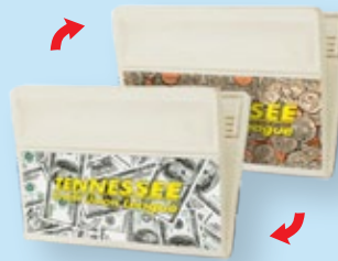
Magnetic Clips MC03-952-I